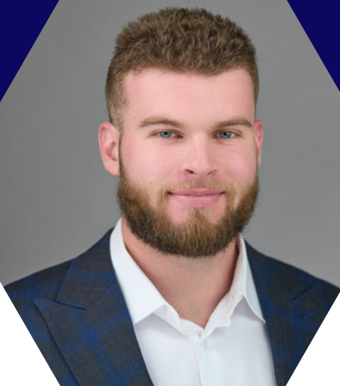
Brandt Franks Recruitment